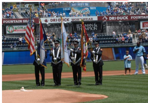
The Fire Department Honor Guard presents the flags at a Kansas City Royals Game. Available upon request, this unit presented the flags at 15 community special events in 2010.